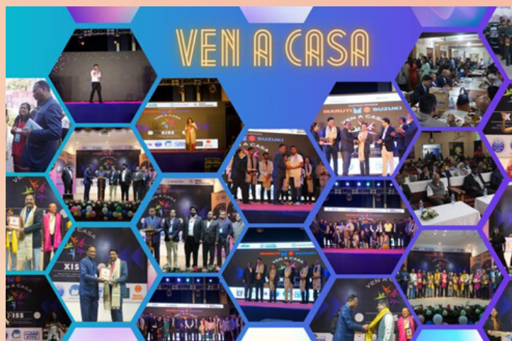
'Ven a Casa' – Annual Alumni Meet celebrated XISS

https://xiss.ac.in/readmore/-ven-a-casa-annual-alumni-meet-celebrated-xiss