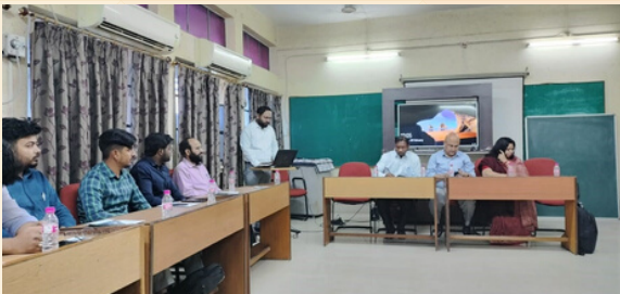
A 2-day orientation session for the newly recruited DPCs and programme members of XISS-UNICEF Project

Considering the significant impact and change the programme has brought in districts, the Sampark programme has been further continued for another 11 months. It is a joint initiative of XISS and UNICEF Jharkhand to provide "Technical support to strengthen SBCC at the district level to improve covid vaccination, ending child marriage, ending violence against children, nutrition and RMNCH+A Routine Immunization" in 12 districts of Jharkhand.