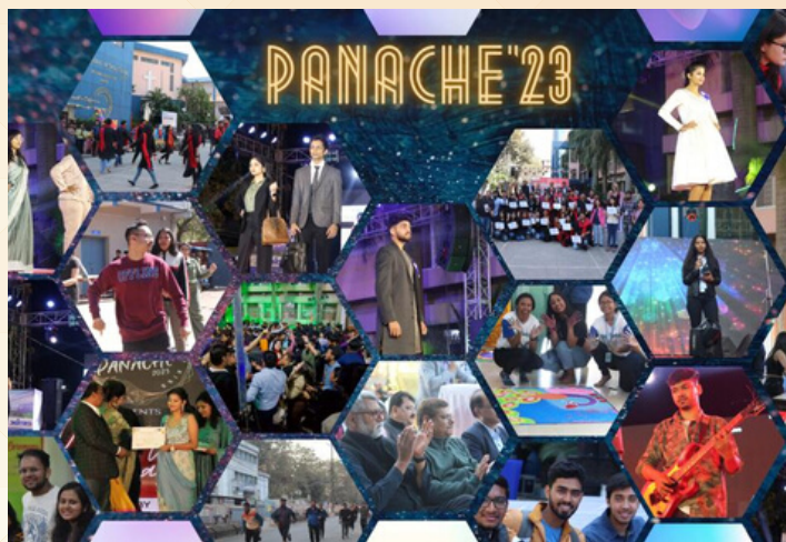
PANACHE '23: The Annual Fest of XISS celebrated with grandeur

XISS, Ranchi, celebrated its two-day Annual Fest 'Panache 2023' on 9-10 February 2023, on the campus. The two-day event witnessed several competitions between students, live musical performances to battling it out in a game of Antakshari between several colleges and institutes.