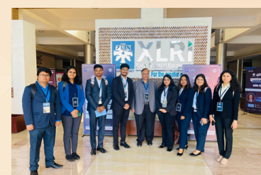
Students of HRM Programme participated in the 12th National HR Conference at XLRI

https://xiss.ac.in/readmore/students-of-human-resource-management-programme-of-xiss-participated-in-the-12th-national-hr-conference-at-xlri