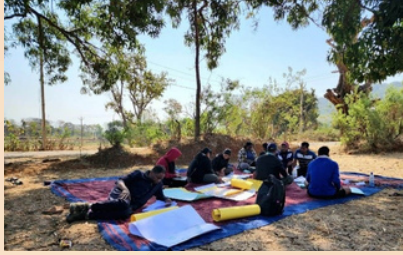
Rural Management students attending the rural camp

Rural Camps are an integral part of the Rural Management programme. Two camps were organized for the first-year students from 23 February – 4 March 2023. The second rural camp for first-year students from batch 2022-24 was organized at Piprabanda,