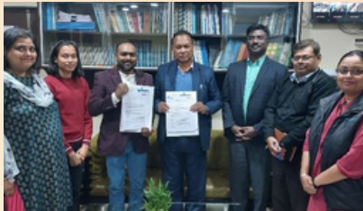
XISS signs an MoU with PHIA Foundation

XISS, it's Rural Management Programme signed an Memorandum of Understanding (MoU) with PHIA Foundation on 7 February 2023. This is an extension of our previous collaboration and partnership with the PHIA