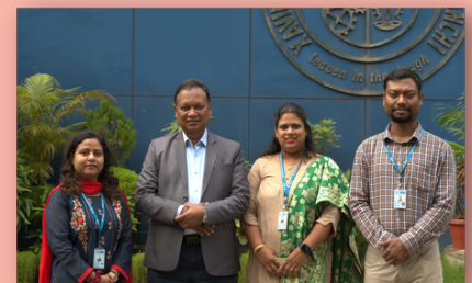
XISS Bulletin Team