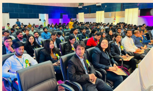
XISS students attend Panel Discussion on e-Waste Management organised by JSPCB